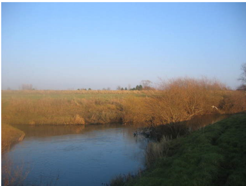
Picture shows the confluence of the Seven and Rye.

Day tickets are available from the usual outlets