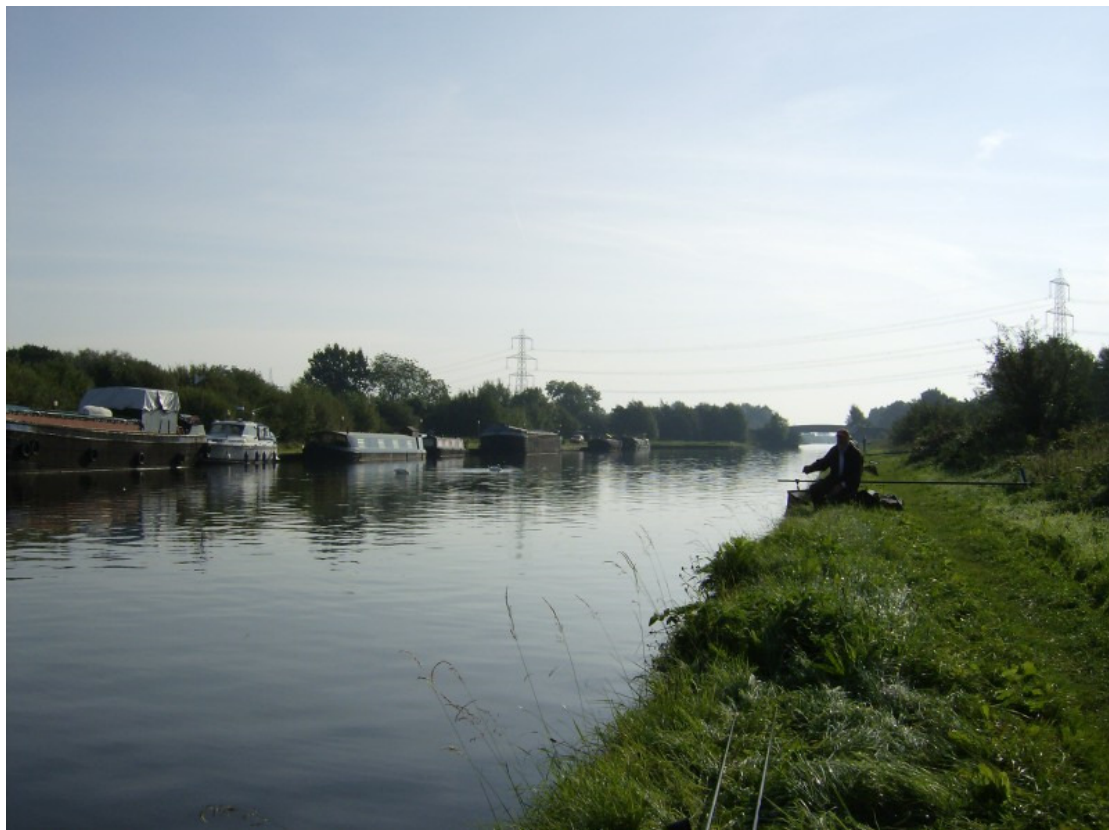
Looking down to Crowcroft Bridge

Please park with care taking care not to obstruct property or farm gates.